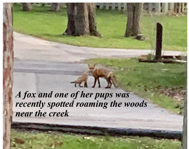
A fox and one of her pups was recently spotted roaming the woods near the creek